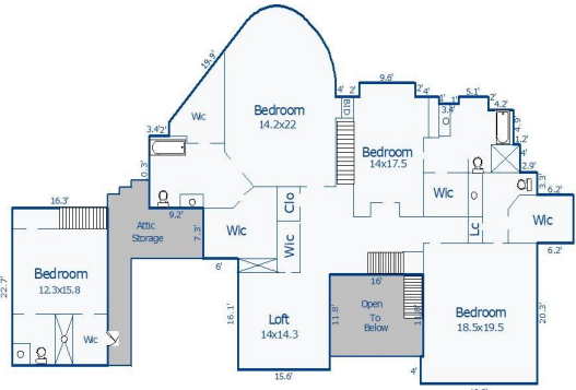
Second Floor (2691 sf.)