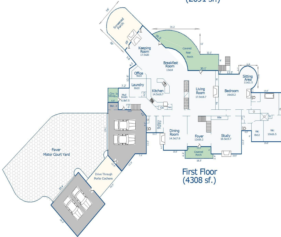
First Floor (4308 sf.)

Above Grade Sf. (6999 sf.) Basement Sf. (3403 sf.) Total GLA: (10,402 sf.)